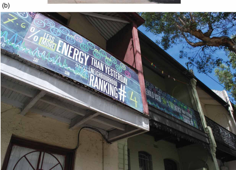
Figures 4a and 4b: Design research on urban visualization. Comparative public visualizations of energy use statistics in Sydney (Australia). The boards showed a set of visualization techniques, including daily performances facts, a neighborhood ranking, an historical energy use graph, and a visual long-term reward in terms of a pictorial bar.

Source: (a) and (b) Vande Moere et al., 2011