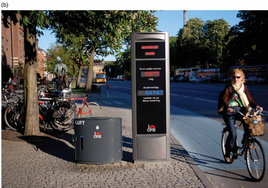
Figures 1a and 1b: Examples of existing forms of urban visualization using digital display technology (a) U.S. Debt Clock in New York City and (b) Cykelbarometer in Copenhagen

Analogue versions of public visualization displays exist as well, as shown in Figures 2a, b, and c. The Tidy Street project (Bird and Rogers, 2011) consists of a huge historical line graph, painted with chalk on a common road, which reveals the historical electricity usage of the street's inhabitants, contrasted to the average values of other UK regions. Although the street display is temporary, it