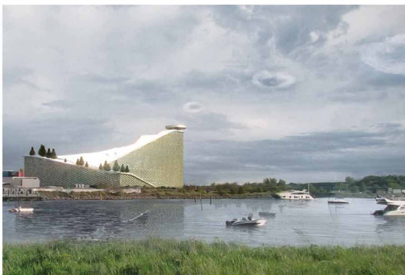
Figures 2a, 2b, and 2c: Figures 2a, 2b, and 2c are examples of urban visualization using “analogue” display technology. (a) Tidy Street, Brighton (U.K.), (b) “Pollstream-Nuage Vert,” Helsinki, and (c) “Big Vortex,” Copenhagen

Sources: (a) Bird et al., 2011, (b) HeHe, 2008, and (c) realities united, 2011.