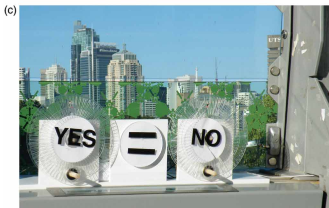
Figures 5a, 5b, and 5c: Figures 5a, 5b, and 5c are examples of design education in urban visualization. They picture experimental but working prototypes. (a) “Lonely Traffic Light” by Silje Johansen, (b) “Waiting Light” by Steve Lukman, and (c) “Urban Polling device” by Jack Zhao