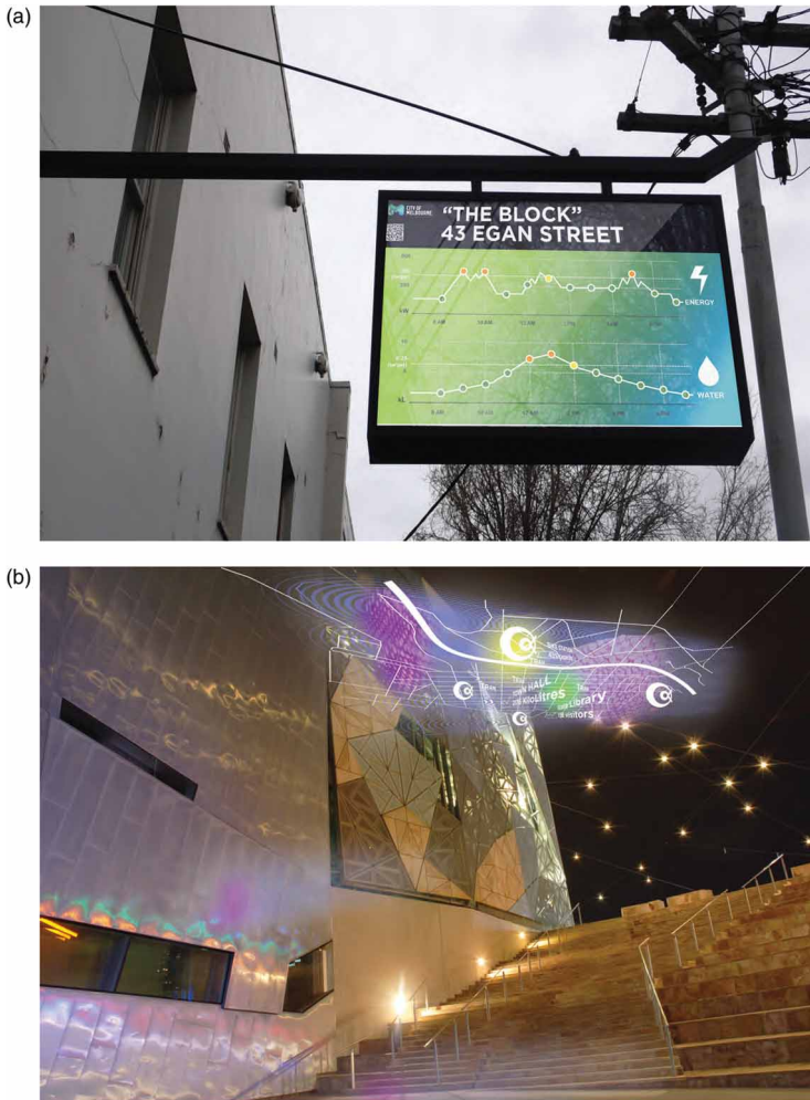
Figures 3a and 3b: Figures 3a and 3b are conceptual ideas of urban visualization for Melbourne’s Smart City Program. (a) Civic Smart Meter: here streets and blocks broadcast their resource data (e.g., energy and water use), (b) The Net, a layered net of LED lights hangs over a Federation Square “laneway,” displaying civic data in real time.