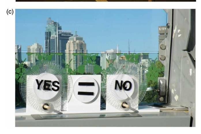
Figures 5a, 5b, and 5c: Figures 5a, 5b, and 5c are examples of design education in urban visualization. They picture experimental but working prototypes. (a) "Lonely Traffic Light" by Silje Johansen, (b) "Waiting Light" by Steve Lukman, and (c) "Urban Polling device" by Jack Zhao