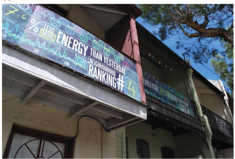
Figures 4a and 4b : Design research on urban visualization. Comparative public visualizations of energy use statistics in Sydney (Australia). The boards showed a set of visualization techniques, including daily performances facts, a neighborhood ranking, an historical energy use graph, and a visual long-term reward in terms of a pictorial bar.