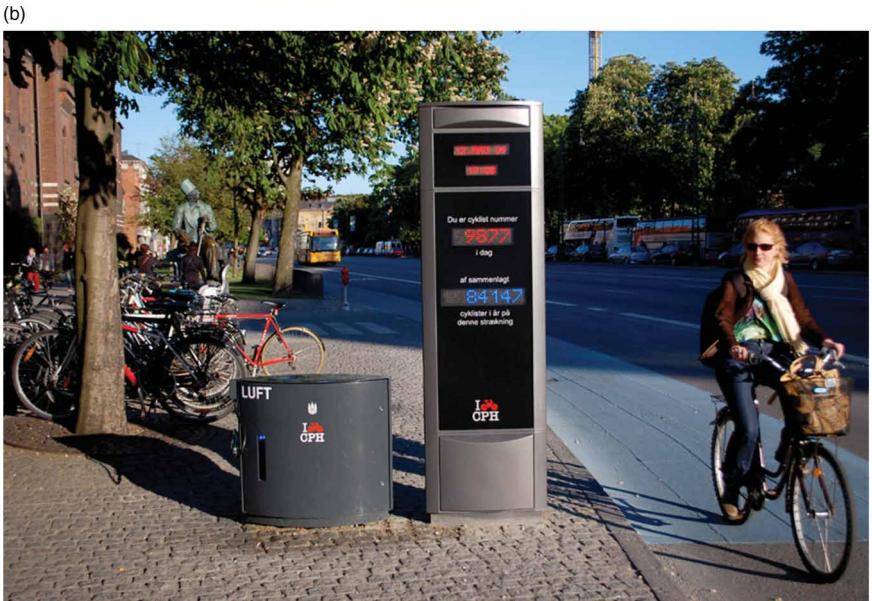
Figures 1a and 1b: Examples of existing forms of urban visualization using digital display technology (a) U.S. Debt Clock in New York City and (b) Cykelbarometer in Copenhagen

Analogue versions of public visualization displays exist as well, as shown in Figures 2a, b, and c. The Tidy Street project (Bird and Rogers, 2011) consists of a huge historical line graph, painted with chalk on a common road, which reveals the historical electricity usage of the street's inhabitants, contrasted to the average values of other UK regions. Although the street display is temporary, it