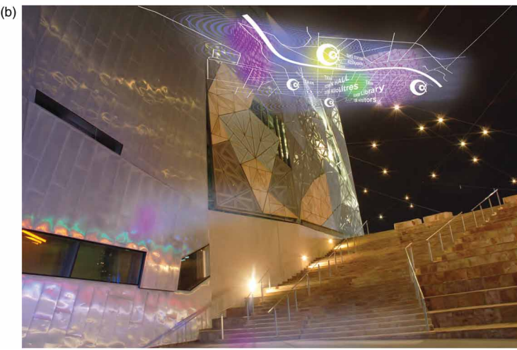
Figures 3a and 3b: Figures 3a and 3b are conceptual ideas of urban visualization for Melbourne's Smart City Program. (a) Civic Smart Meter: here streets and blocks broadcast their resource data (e.g., energy and water use), (b) The Net, a layered net of LED lights hangs over a Federation Square "laneway," displaying civic data in real time.

tend to be concerned about the apparent validity of the comparison groups (Roberts et al., 2004). Public and open comparison of behavioral data has some important drawbacks: while bad-performing participants might change their behavior positively when being confronted with those of others, good-performing participants tend to do the opposite, as they feel much less encouraged when noticing their already positive behavior, and feel no immediate objection to move towards the "average" (Brandon et al., 1999).