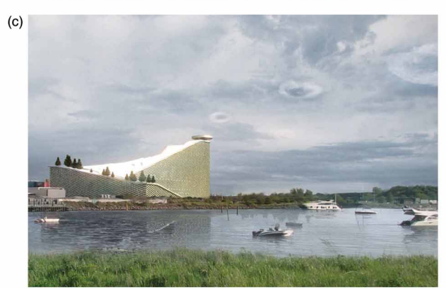
Figures 2a, 2b, and 2c: Figures 2a, 2b, and 2c are examples of urban visualization using "analogue" display technology. (a) Tidy Street, Brighton (U.K.), (b) "Pollstream-Nuage Vert," Helsinki, and (c) "Big Vortex," Copenhagen